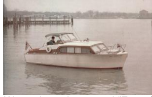
Werner's yacht, named "Focus"