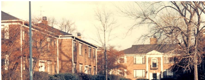
Park Lasalle Apartments