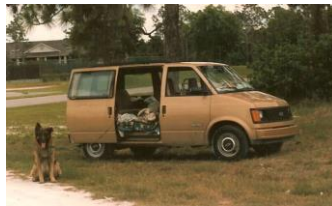
Bear in front of my mini van