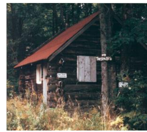
Cabin at entrance to Deer Lake