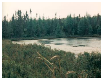
Deer Lake, Barbeau