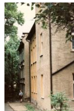
Jena Student Apartment