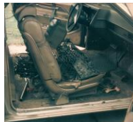
inside of burned out Eldorado