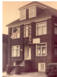
Hotel 1919 Wyoming