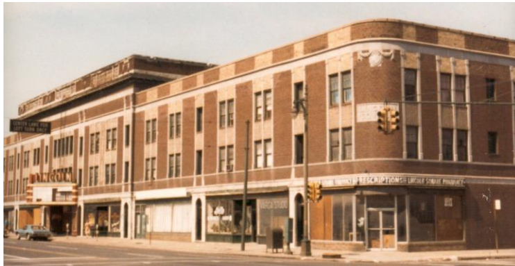
Lincoln Square Building