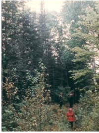
1600 acres, Barbeau

and we were again on our way, 15 minutes lost due to Werner's feeling absolutely sure that there was an exit up ahead.)